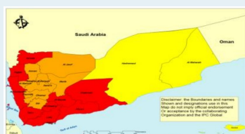
Yemen IPC Acute Food Insecurity Overview, June 2015