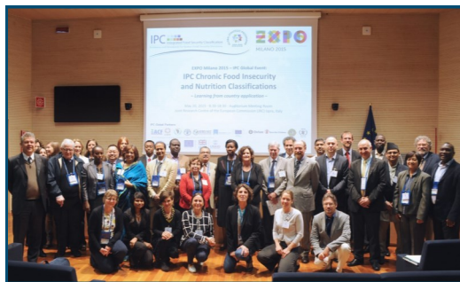
3rd IPC Global Event - EXPO Milano 2015, 20 May 2015