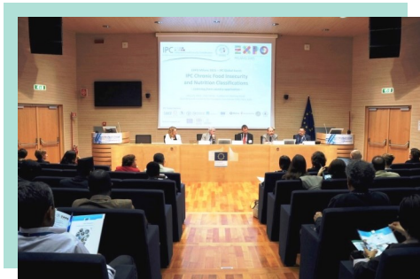
3rd IPC Global Event - EXPO Milano 2015, 20 May 2015

This year edition of the IPC Global Event , held on the 20th of May in EC-JRC Headquarters in Ispra (Italy), was attended by around 50 participants, including representatives of global IPC stakeholders, partner and resource partners, regional inter-government bodies (CILSS, IGAD, SAARC and SICA) and national government representatives.