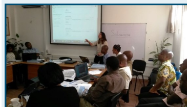
IPC Acute Food Insecurity Analysis Workshop in Mozambique, 22-26 June 2015