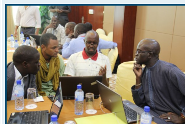
IPC Acute Malnutrition Classification Pilot in Niamey, Niger - May 2015