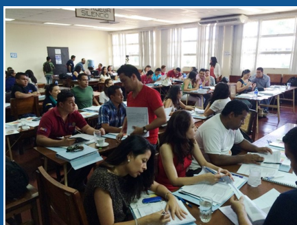
IPC Acute Food Insecurity Analysis in South Sudan, April 2015