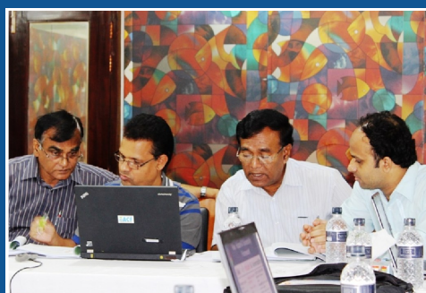
IPC-Acute Level 2 Training in Bangladesh, June 2014