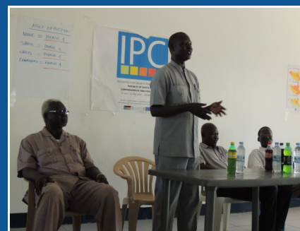
IPC Acute Food Insecurity Analysis in South Sudan, April 2015