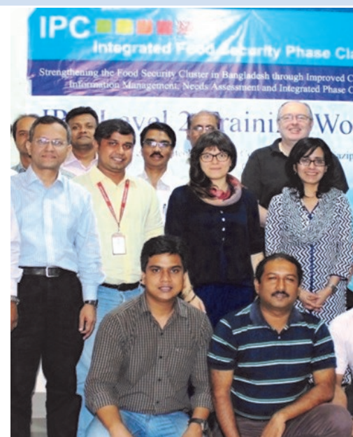
IPC Level 2 Training in Bangladesh March 2014