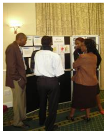
Fig. 5 - Market stations: IPC in Ivory Coast and IPC in Burundi