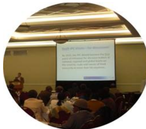
Fig. 4 – Presentation of the IPC Vision

The principle of subsidiarity is at the core of the approach, permitting the decentralisation of the analysis and information collection to be as close as possible to the affected population.