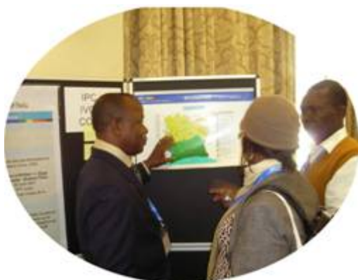
Fig. 2 – Participants sharing information on activities in East and Central Africa

Progress of the IPC in Central and Eastern Africa: In mid-2005 a Food Security and Nutrition Working Group (FSNWG) was established with 20 member organisations, to create consensus, share information and develop joint food security and nutrition tools. The FSNWG oversees the implementation and steers the development of the IPC in the region.