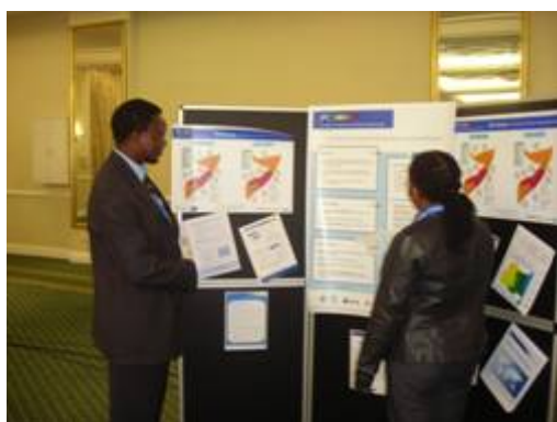
Fig. 3 – IPC display stand

Background: The region has a number of food security or related institutions/actors, however they are using a number of different methodologies and a need for harmonization was identified at a regional technical steering committee in 1999; this led to the creation of the Cadre Harmonise . With the advent of the IPC there were discussions on how to best integrate the existing Cadre Harmonise with the IPC leading to the Cadre Harmonise Bonifié . The key milestone was a meeting held in June 2009.