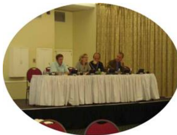
Fig. 9 – Concluding Remarks

The IPC is not a new architecture but a tool for analysis of existing ones. The IPC needs to expand and can expand with the increasing demand, whilst addressing the challenge of ensuring quality. There is a movement from concentrating on the technical issues to institutionalisation with improving the governance as its core. To ensure that the IPC is successful, donors financing the IPC need to be diversified and better integrated into the food clusters and UN reform to promote a more supportive structure.