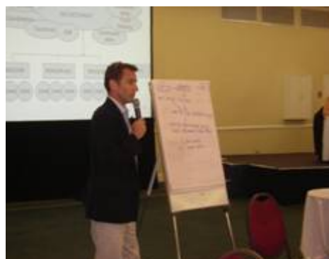
Fig. 7 – Working Group for West Africa