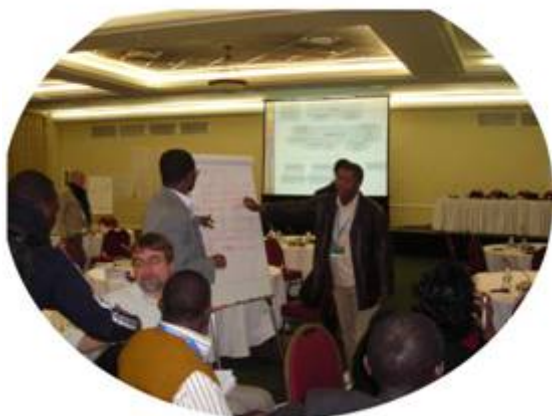
Fig. 6 – Working Group for Southern Africa

The objective of the day was to improve how the IPC partnership works and to plan the next steps.